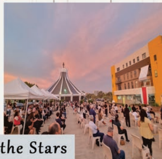
Christmas Adoration - Under the Stars