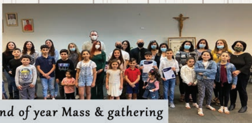
OLOL Arabic School end of year Mass & gathering