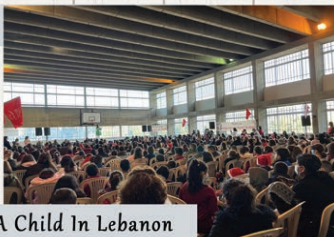
From A Child in Australia to A Child In Lebanon