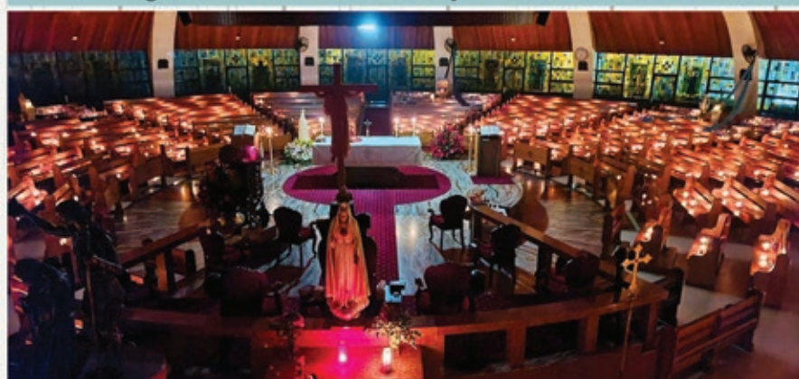
You are all with us at Church with your candles & rosaries lighting up our parish with your intentions for the Feast of the Assumption