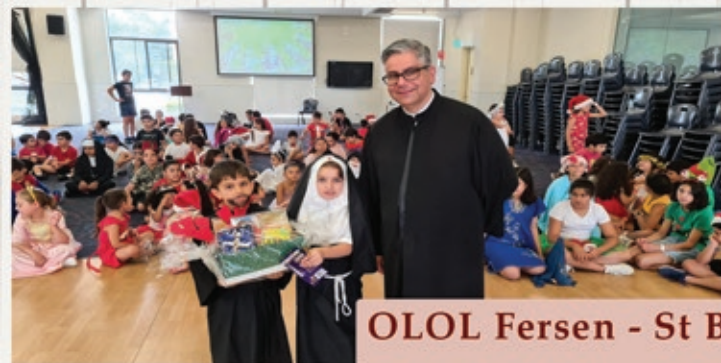
OLOL Fersen - St Barbara & Christmas Party