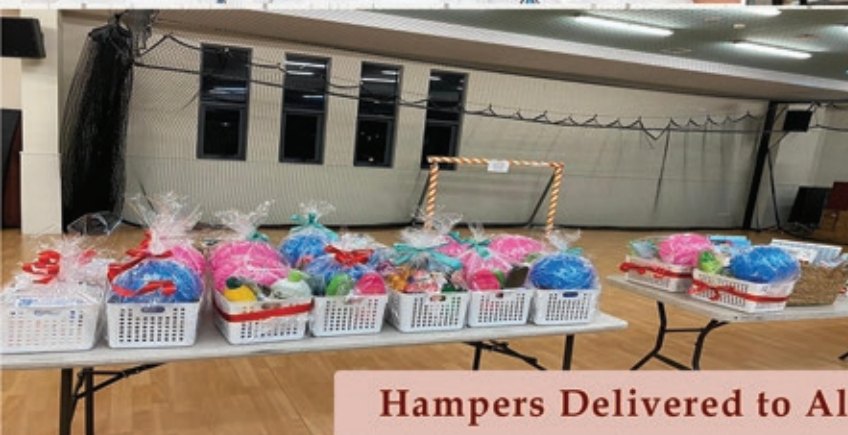
Hampers Delivered to Allowah Children Hospital