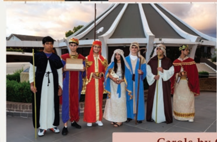
Carols by Candlelight