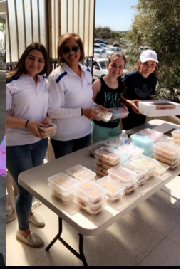
Heaven on Earth Fundraiser