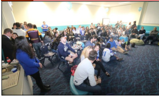
Origin Game 1 Join us for a fun night for game 2 in the CYPC.