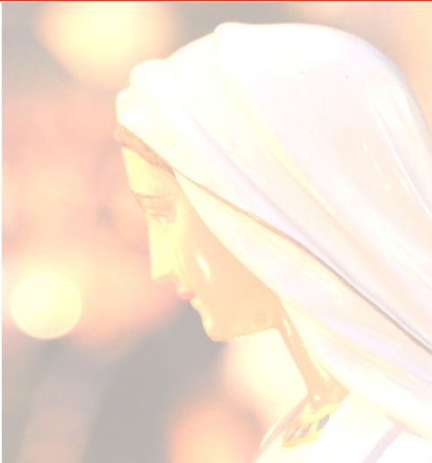
Procession in the streets of Harris Park to celebrate the end of the MARIAN MONTH