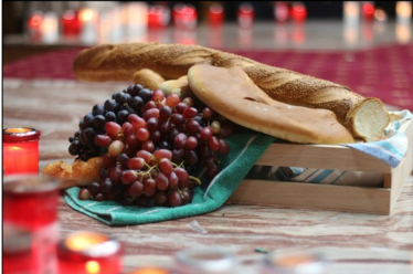
Feast of CORPUS CHRITI procession