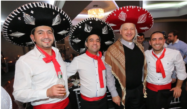
OLOL Youth had a wonderful night on Friday at their "Around the world" Dinner Dance.