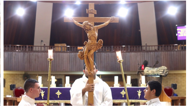
Stations of the Cross, evening prayers & adoration of the Cross every Friday night of Lent.