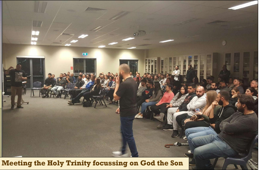
Thursday Bible Studies - Meeting the Holy Trinity focussing on God the Son