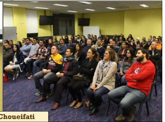
When the Cross gets Heavy by Jade El-Choueifati