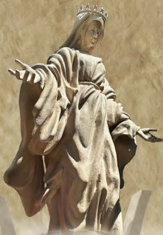
New OLOL Statue