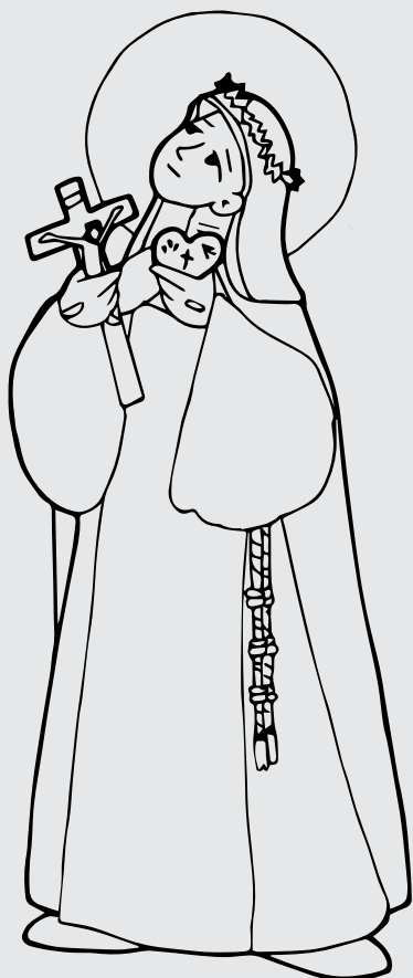
St Veronica Giuliani