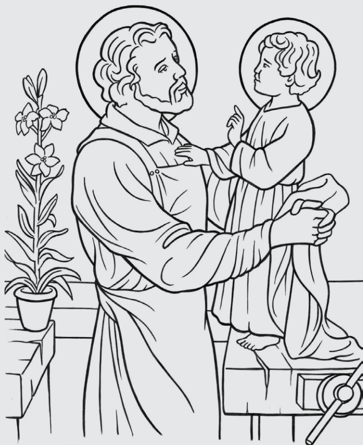
Saint Joseph & Jesus